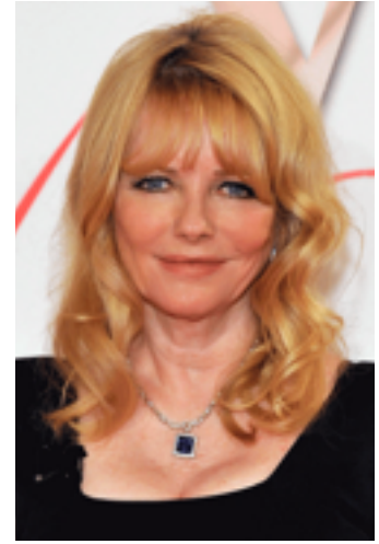
Cheryl Tiegs, more recently, but she's probably not 73 in this photo.

Did you know that America's first "Supermodel", Cheryl Tiegs , is of 100% German descent? It's true. Perhaps you remember the famous poster on the left, which superseded the iconic Farrah Fawcett-Majors poster. Tiegs appeared four years in a row in the Sports Illustrated swimsuit issue, and she was on the cover of Time, Glamour, Harper's Bazaar, and Vogue magazines. She capitalized on her modeling success with a line of clothing endorsements at Sears. Today, at age 73, she is active in many philanthropic organizations. Cheryl says of herself, "I'm very strong-minded. I'm German, my family is all German, from Minnesota."