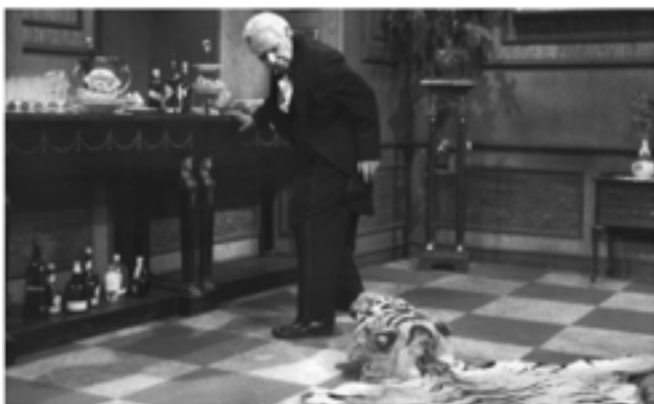
Dinner for One is watched by millions of Germans every New Year's Eve.

https://www.youtube.com/watch?v=FksV_7ZYbhY