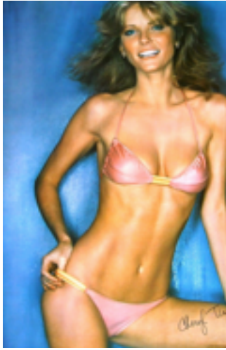
Cheryl Tiegs, 1978 "Pink Bikini" poster.

Did you know that America's first "Supermodel", Cheryl Tiegs , is of 100% German descent? It's true. Perhaps you remember the famous poster on the left, which superseded the iconic Farrah Fawcett-Majors poster. Tiegs appeared four years in a row in the Sports Illustrated swimsuit issue, and she was on the cover of Time, Glamour, Harper's Bazaar, and Vogue magazines. She capitalized on her modeling success with a line of clothing endorsements at Sears. Today, at age 73, she is active in many philanthropic organizations. Cheryl says of herself, "I'm very strong-minded. I'm German, my family is all German, from Minnesota."