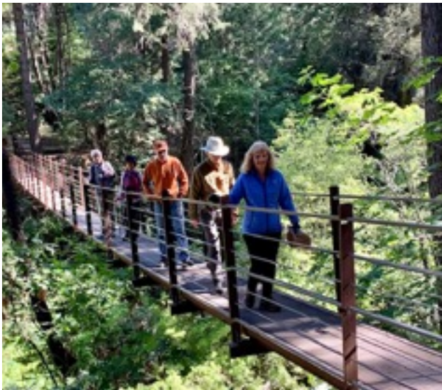
Happy Wanderers crossing Deer Creek on the suspension footbridge during the Tribute Trail hike.

Ten Happy Wanderers met up at the parking lot on Main Street in Downieville. We began our hike here on a wonderful May morning. It was warm, but not hot, with gentle breezes. We walked 20 minutes through the historic old town across old Hospital Bridge and the Downie River to the trailhead. From the trailhead we began our trek up beautiful Pauley Creek in the shade of a wonderful forest with steep mountains and stunning scenery for about 90 minutes to a great creekside lunch on the creek. We then returned to town to enjoy well-deserved ice cream 🍦. Everyone enjoyed the hike.