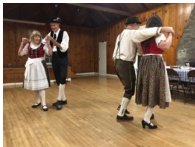
Alpine Dancers at the Seaman's Lodge performing during the Stollen auction on November 1.